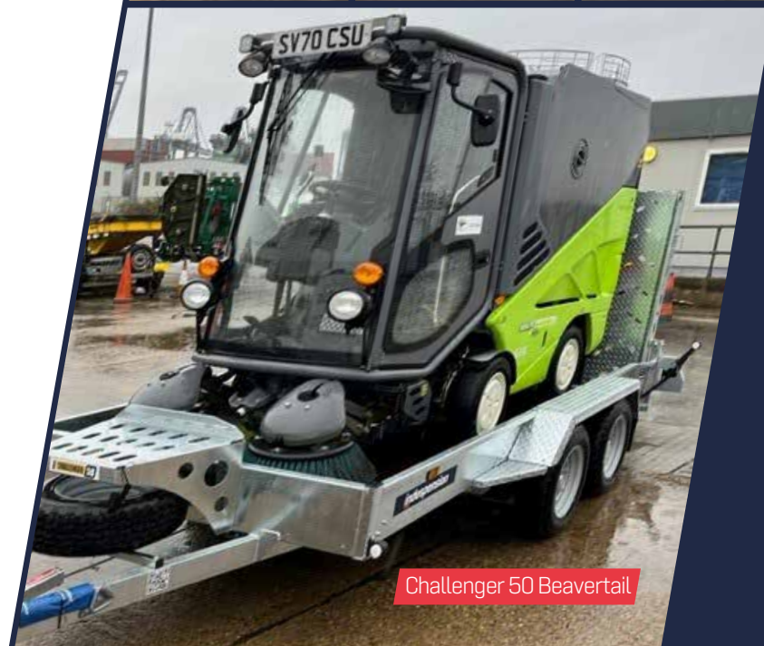
Challenger 50 Beavertail