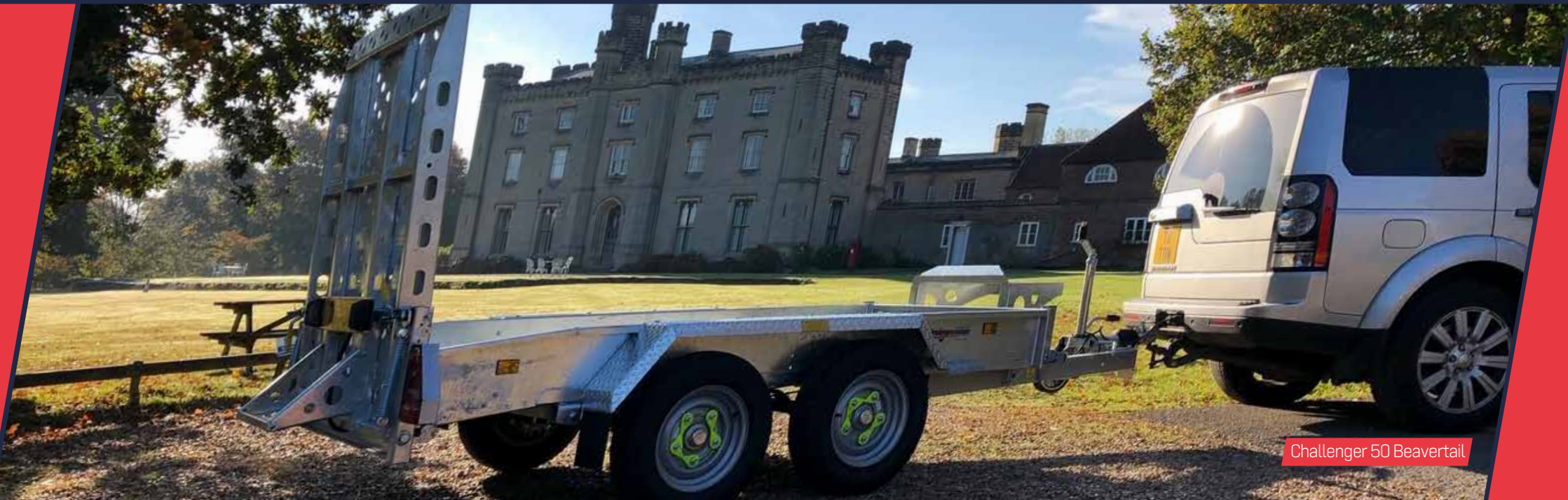
Challenger 50 Beavertail